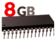
AVAILABLE UPTO 8GB SYSTEM MEMORY