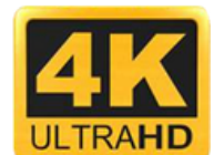
4K ULTRA HIGH DEFINATION