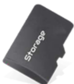
PRIMARY:- 128GB + SECONDARY:- 1TB