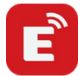
WIRELESS SCREEN SHARING UPTO 4 DEVICES