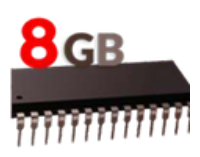
AVAILABLE UPTO 8GB SYSTEM MEMORY