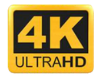
4K ULTRA HIGH DEFINATION