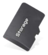
PRIMARY:- 128GB + SECONDARY:- 1TB