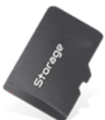
PRIMARY:- 128GB + SECONDARY:- 1TB