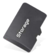
PRIMARY:- 128GB + SECONDARY:- 1TB