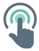
20 POINT TOUCH